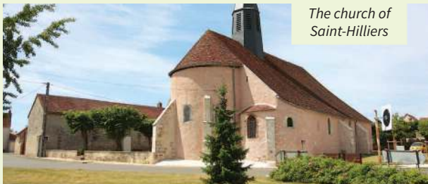
The church of Saint-Hilliers

There was a seigniorial castle and dungeon as early as the 11th century in Quincy. From the 16th century until the French Revolution, this estate was owned by successive lords; two families each remained there for a century, the Brunfay and du Tillet. All that remains of the castle is the dungeon. A beautiful farmhouse graces this hamlet.