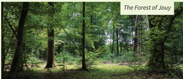
The Forest of Jouy

Edition Provins Tourisme - Codérand 77 - Conception et réalisation : CreaClic - 09/2020 - 250 ex. - The information provided might be subject to changes.