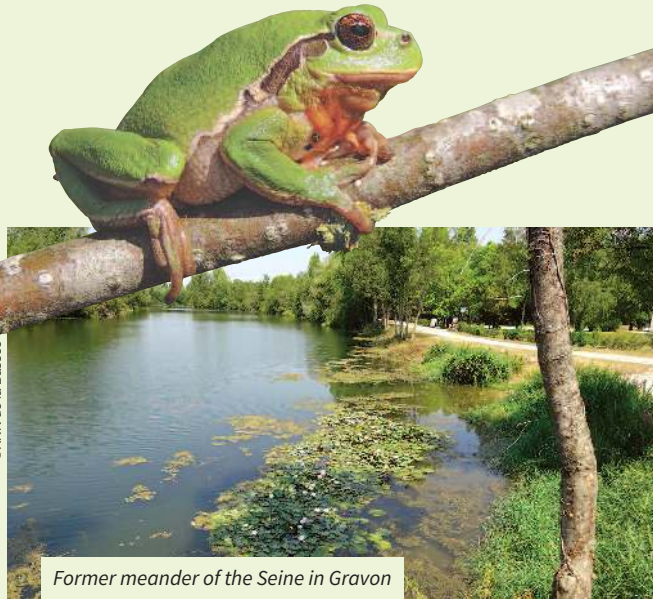
Former meander of the Seine in Gravon

The fauna is also delightful, and includes the tree frog (which climbs trees). It is often hard to see. A common French children's song says "it's raining, it's wet, it's a frog party!" Many migratory birds rest in the gravel pits on the left bank of the Seine.