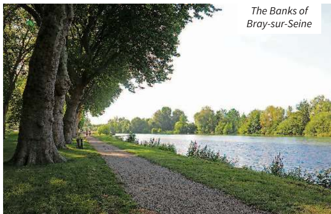
The Banks of Bray-sur-Seine