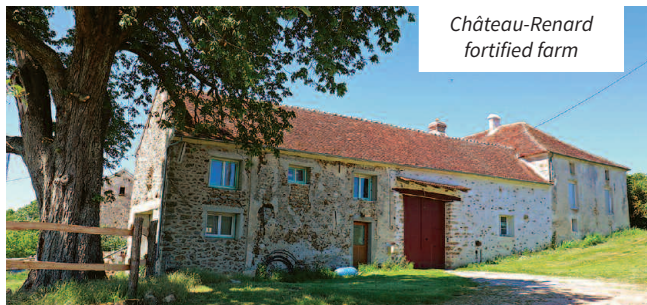
Château-Renard fortified farm