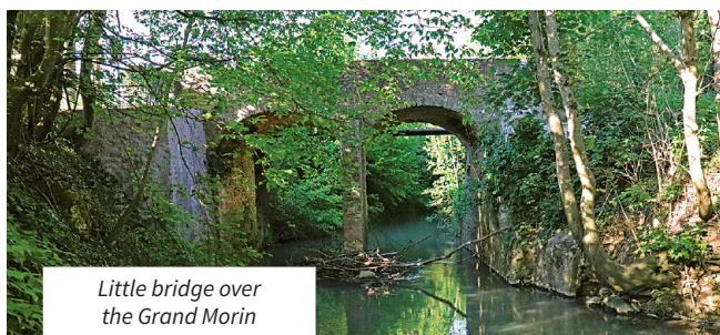
Little bridge over the Grand Morin