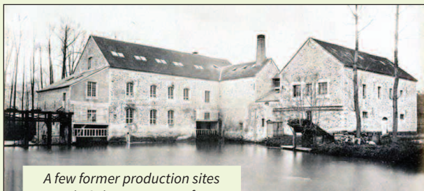
A few former production sites in Seine-et-Marne of the Marais paper mills

Later, the Marais paper mills started manufacturing paper money mostly for countries in Asia and Africa, but had to close, because of the downturn in the use of paper money worldwide.