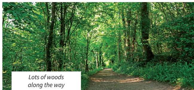
Lots of woods along the way