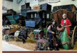
The "Musée de la Vie d'Autrefois" in Les-Ormes-sur-Voulzie