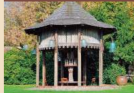
The "Point du Jour" garden in Verdelot