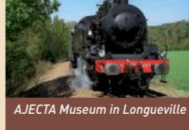
AJECTA Museum in Longueville