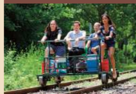
Ferra Botanica in La Ferté-Gaucher