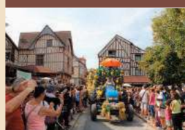
Harvest Festival of Provins