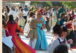
Medieval Festival of Provins