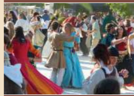
Medieval Festival of Provins