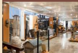
Museum in Saint-Cyr-sur-Morin