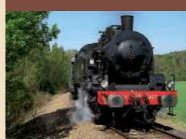
AJECTA Museum in Longueville