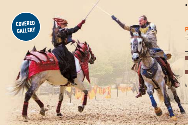
A show produced by Equestro.

PRICES: adult 12,50 € - child 8 € (4-12 years old). → Cut-prices with the Pass Cards: adult 11 € - child 6,50 € (4-12 years old). → Other reduced prices, ask organizer. ■ Doors open 30 min. before the beginning of the show. ■ Length: 45 min.