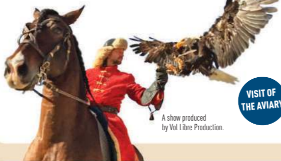
A show produced by Vol Libre Production.

PRICES: adult 12,50 € - child 8 € (4-12 years old). → Cut-prices with the Pass Cards: adult 11 € - child 6,50 € (4-12 years old). → Other reduced prices, ask organizer. ■ Doors open 30 min. before the beginning of the show. ■ Length: 50 min.