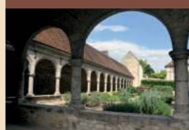
Cloister of Donnemarie-Dontilly