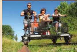
Ferra Botanica in La Ferté-Gaucher